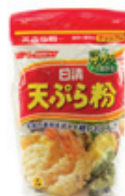
TEMPURA POWDER Code : SS042B, SS042D Packing : 700 GMS, 500 GMS