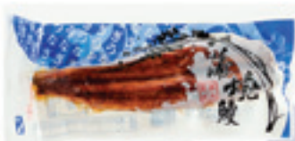
UNAGI KABAYAKI (BROILED EEL) Code : FR027 Packing : 250 GMS