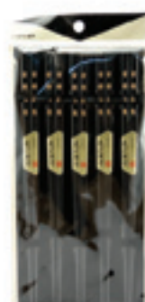
BLACK CHOPSTICKS Code : DR029 Packing : 5 Pairs Pack