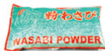
WASABI POWDER (HORSERADISH POWDER) Code : SS027B, SS026 Packing : 1 KG, 200 GMS