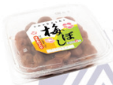
UMEBOSHI (PICKLED PLUM) Code : PV002 Packing : 350 GMS