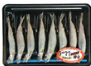
SHISHAMO Code : FR018 Packing : 85 GMS