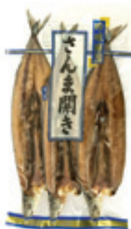
SANMA HIRAKY (PIKE) Code : FR069 Packing : 130 Gms