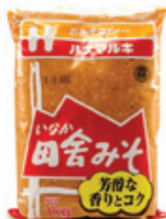
INAKA MISO (RED SOYBEAN PASTE) Code : SS002A Packing : 1 Kg