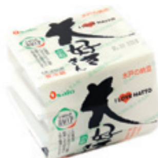
MINI NATTO Code : FR030E Packing : 3 X 50 GMS