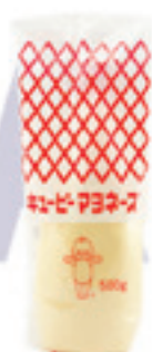
MAYONNAISE Code : SS012, SS012A Packing : 500 GMS, 1Kg