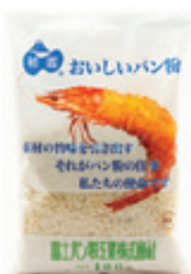
PANKO (BREAD CRUMBS) Code : SS040C, SS040, SS040B Packing : 400 GMS, 1 Kg, 500 GMS