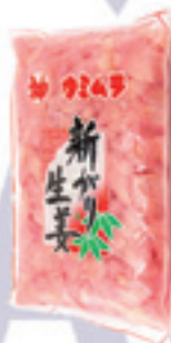
GARI SHOUGA (PICKLED GINGER) Code : PV005A, PV005B (White Gari) Packing : 1 KG, 1 KG