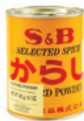
KARASHI KO (MUSTARD POWDER) Code : SS025 Packing : 400 GMS