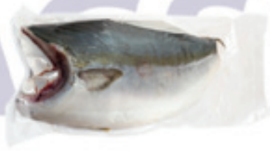
HAMACHI FILLET ( YELLOW TAIL FISH) Code : FR061C Packing : 1.25 KG (Approx)