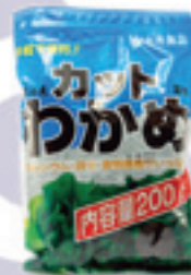
WAKAME SEAWEED Code : DR010B, DR010, DR010A Packing : 200 GMS, 18 GMS, 500 GMS