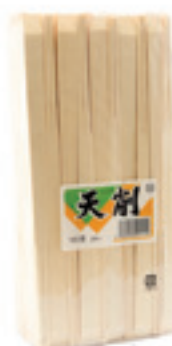
TENSOGI WARIBASHI (WOODEN CHOPSTICKS) Code : DR021C Packing : 100 Pairs Pack