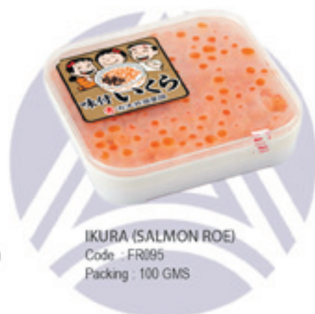
IKURA (SALMON ROE)

Code : FR090A, FR090B (GREEN), FR090 (BLACK) Packing : 500 GMS