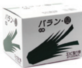
BARAN (DECORATION FOR SUSHI) Code : KW011A Packing : 1 X 1000SPACK