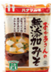
OKASAN MISO (SOY BEAN PASTE) Code : SS001 Packing : 1 KG