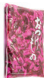
SHIBA ZUKE (MIX VEG PICKLE) Code : PV008B, PV008C Packing : 1 Kg, 1 Kg