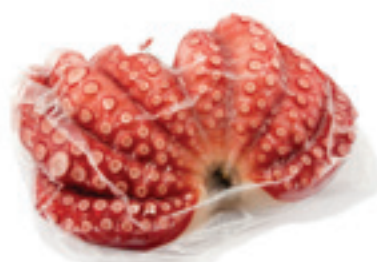
TAKO (BOILED OCTOPUS) Code : FR016 Packing : 1 KG