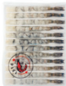
NOBASHI EBI (TEMPURA PRAWNS) Code : FR064B Packing : 4L 12 pcs pack