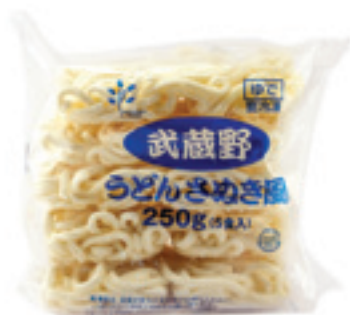
HONBA SANUKI UDON (FRESH NOODLE) Code : FR063A, FR063C, FR063 Packing : 5 X 250 GMS, 600 GMS, 250 GMS