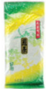
SENCHA (GREEN TEA) Code : DR0001, DR001C Packing : 100 GMS, 1 Kg