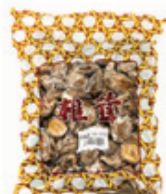
SHITAKE MUSHROOM Code : DR013A, DR013 Packing : 1 KG, 500 GMS