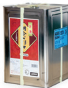
SESAME OIL Code : SS021A Packing : 6.5 Kg (18 Litres)