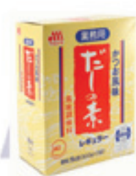
DASHINO MOTO Code : SS063B, SS063A Packing : 1 Kg, 150 GMS