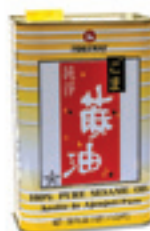
SESAME OIL Code : SS20, Packing : 1.56 Kg (1.70 Litre)