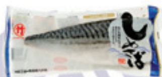
SHIME SABA Code : FR020A Packing : 130 GMS