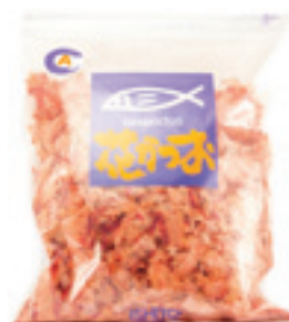
HANAKATSUO UME (BONITO FLAKES) Code : SS118 Packing : 500 GMS