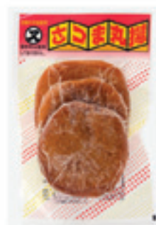
SATSUMAGE (FRIED FISH PASTE) Code : FR065 Packing : 170 GMS