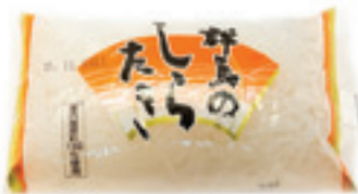
SHIRATAKI (YAM THREAD) Code : CA017 Packing : 200 GMS