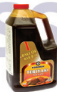
TERIYAKI SAUCE Code : SS060 Packing : 2.25 Kg