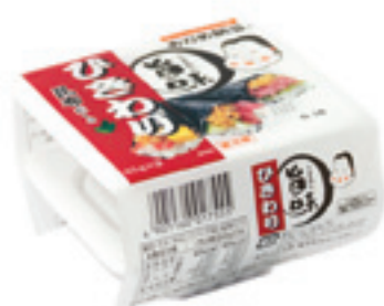
HIKIWARI NATTO Code : FR030B Packing : 2 X 50 GMS