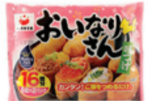
INARI (FRIED BEAN CURD) Code : CA022A Packing : 240 GMS