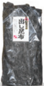
DASHI KONBU Code : DR011D, DR011A Packing : 1 KG, 50 GMS