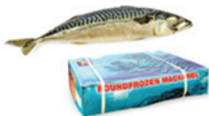
FROZEN SABA MACKEREL