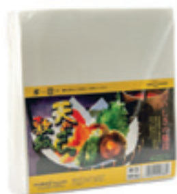
TEMPURA PAPER Code : KW010 Packing : 500 SHEETS PACK