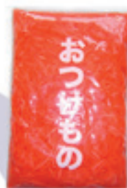
BENI SHOUGA ( RED GINGER PICKLE) Code : PV004A Packing : 1 KG