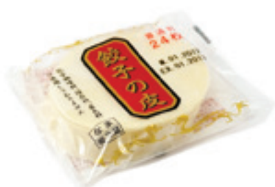
GYOZA NO KAWA ( GYOZA SKIN ) Code : FR034A Packing : 140 GMS