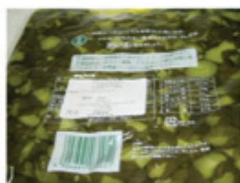
PARIKKO (CUCUMBER PICKLE) Code : PV13 Packing : 1 KG