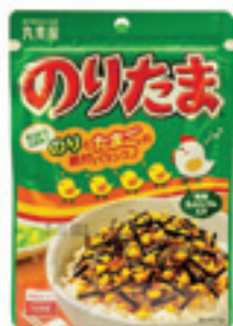
FURIKAKE NORITAMA (RICE SEASONING) Code : DR008 Packing : 30 GMS