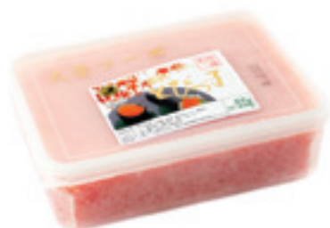
TOBIKKO ORANGE (FLYING FISH ROE)

Code : FR090A, FR090B (GREEN), FR090 (BLACK) Packing : 500 GMS