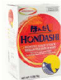
HONDASHI POWDER Code : SS037A, SS037 Packing : 1 KG, 150 GMS