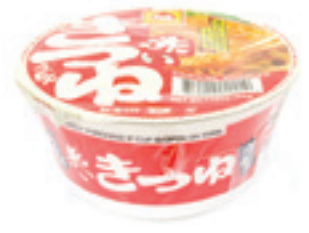
AKAI KITSUNE UDON Code : ND023 Packing : 90Gms