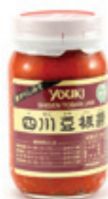
TOBANJAN Code : SS054A Packing : 225 GMS