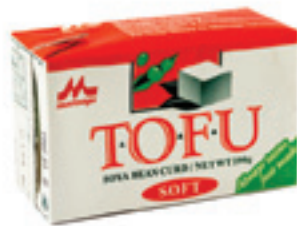
TOFU SOFT (SOY BEAN CURD) Code : DR018 Packing : 297 GMS