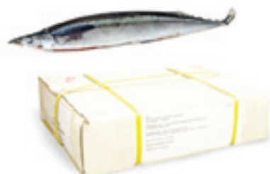
SANMA (MAKERAL PIKE)

Code : FR055B Packing : 10 KG BOX (60 - 80 Pcs / Box)