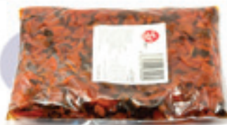
FUKUIN ZUKE (MIX PICKLE) Code : PV023 Packing : 1 KG