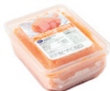
MASAGO (CAPELINE ROE)