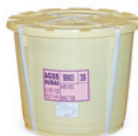
SHIRO MISO ( SOYBEAN PASTE) Code : SS003 Packing : 20 Kg