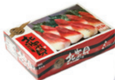
HOKI GAI (SURF CLAM) Code : FR056 Packing : 1 KG