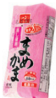
KAMABOKO RED Code : FR001A, FR002B (White) Packing : 120 GMS, 120 GMS