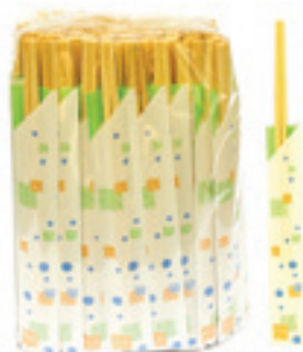
RIKYU WARIBASHI (WOODEN CHOPSTICKS) Code : DR021 Packing : 100 Pairs Pack