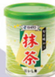
MACHA (GREEN TEA POWDER) Code : DR001A Packing : 30 GMS