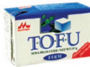
TOFU FIRM (SOY BEAN CURD) Code : DR018A Packing : 297 GMS