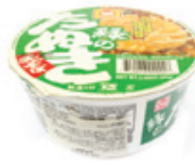
MIDORI NO TANUKI SOBA Code : ND019 Packing : 100 Gms