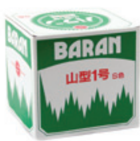
BARAN (DECORATION FOR SUSHI) Code : KW011 Packing : 1000 Pcs Pack