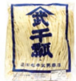
KANPYO (DRIED GOURD SHAVINGS) Code : DR020 Packing : 1 Kg