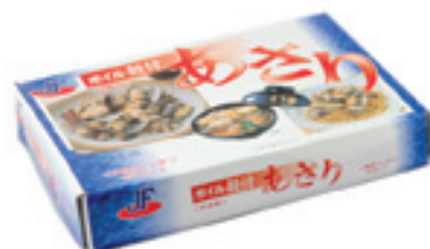
ASARI (BABY SCLAM) Code : FR026 Packing : 500 GMS