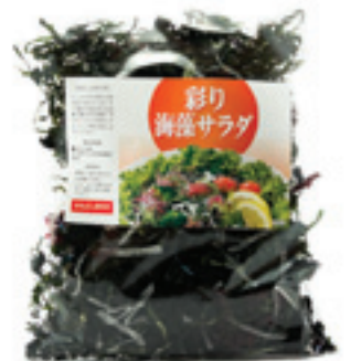
KAISO SALAD Code : DR027 Packing : 100 GMS