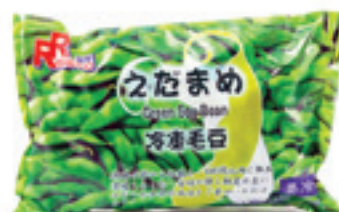
EDAMAME ( GREEN SOY BEANS) Code : FR031A Packing : 500 GMS