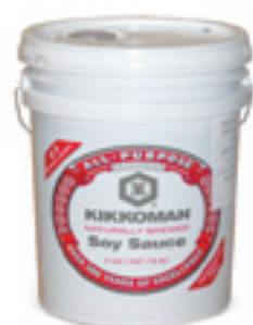
KIKKOMAN SOY SAUCE Code : SS004A, SS4C Packing : 18.9 Litres, 3.79 Litres