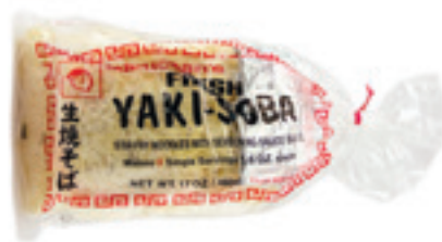
NAMA YAKISOBA (FRESH FRIED NOODLE) Code : FR038 Packing : 450 GMS