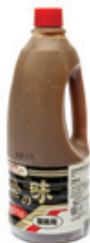
OGONO NO AJI CHUKKARA (BARBECUE SAUCE) Code : SS094A Packing : 1.56 KG