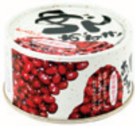
YUDE AZUKI (BOILED RED BEAN) Code : CA008A Packing : 210 GMS