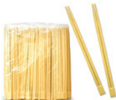
BAMBOO CHOPSTICKS Code : DR019 Packing : 5 Pairs Pack