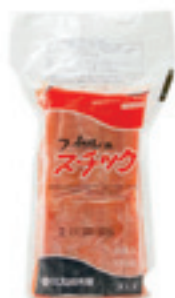
KANI KAMABOKO (CRAB STICK)