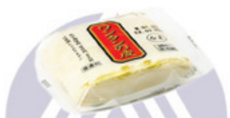
WANTAN NO KAWA (WANTAN SKIN) Code : FR042 Packing : 140 GMS