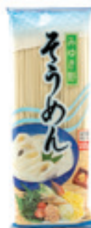
SOU MEN NOODLE Code : ND005A Packing : 220 GMS