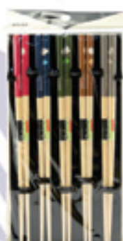
CHOPSTICKS MULTI COLOUR Code : DR28 Packing : 5 Pairs Pack