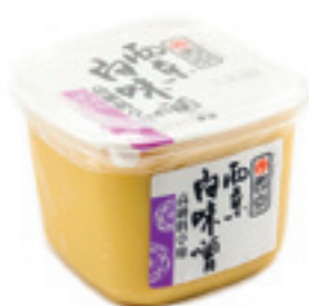
SAIKYO SHIRO MISO Code : SS001A Packing : 1 KG