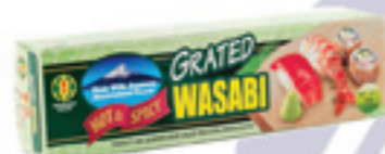
WASABI PASTE Code : SS026A Packing : 43 GMS