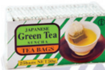
SENCHA (GREEN TEA) BAG Code : DR001B Packing : 2x25 GMS