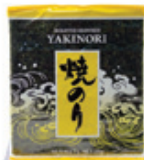
NORI (SEAWEED WRAPPER) Code : DR005B, DR005E Packing : 25 GMS, 300 GMS