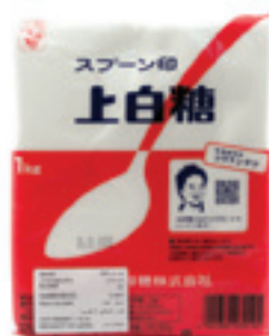
JOHAKUTO (REFINED SUGAR) Code : SS101 Packing : 1 KG