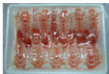
SUSHI EBI 4L (SUSHI SHRIMP) Code : FR064 Packing : 30 pcs pack