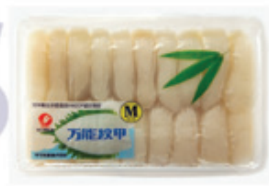
BANNOU IKA (FROZEN CUT SQUID ) Code : FR046A Packing : 700 GMS