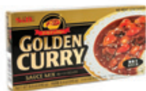
GOLDEN CURRY HOT Code : SS029B, SS030B MED. HOT & SS031B - MILD Packing : 240 GMS