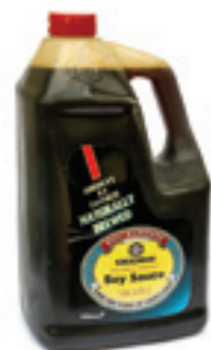
KIKKOMAN SOY SAUCE Code : SS004C Packing : 3.79 Litre