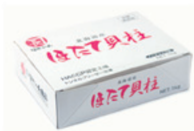
HOTATE KAIBASHIRA (SCALLOPS) Code : FR015 Packing : 1 KG