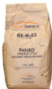
PANKO Code : SS041 Packing : 20 LBS. (9.07 Kg)