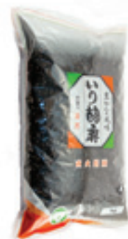
ROASTED SESAME SEED Code : SS081B, SS082B (White) Packing : 1 KG, 1 KG